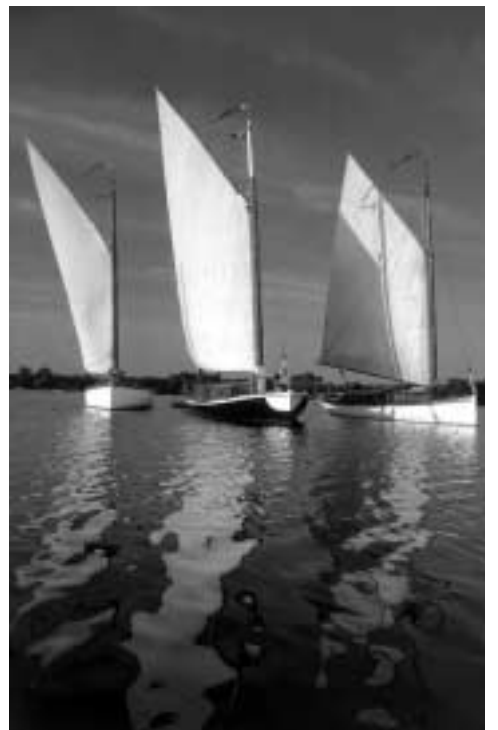
Designed by PaperWhite, London.